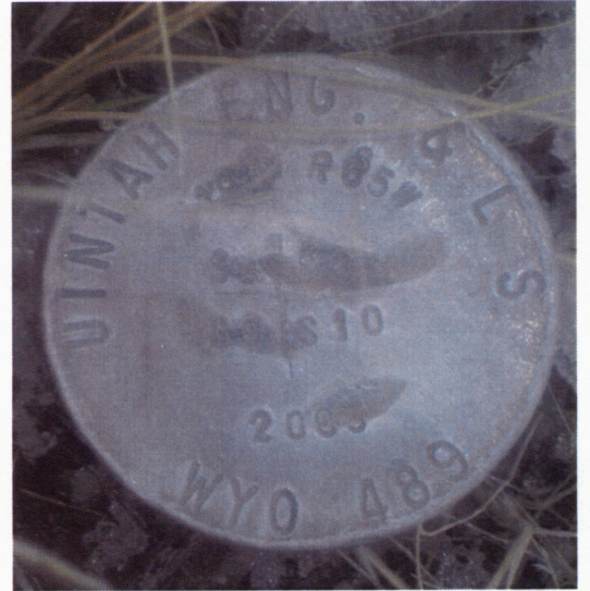
FOUND: ALUMINUM CAP, PLS 489